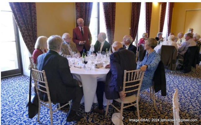
The President, Chairman and Immediate Past President confer!